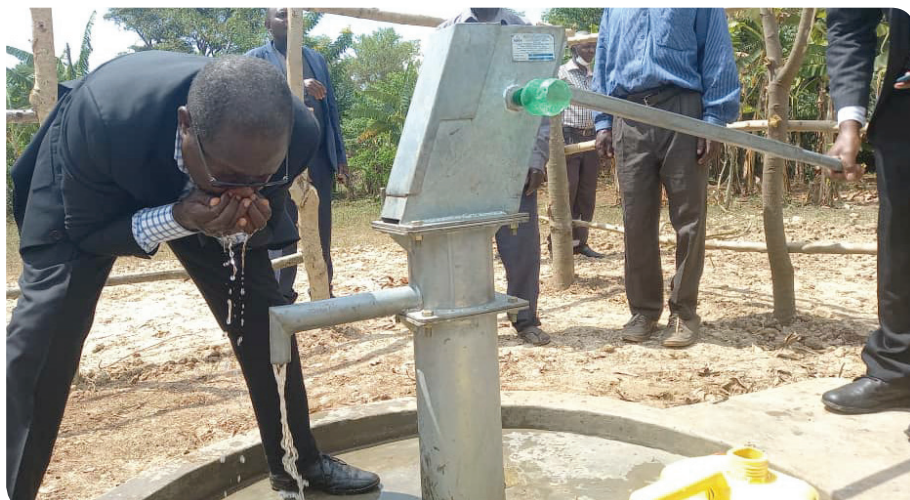
A borehole that was drilled by LMU in Namalembe, Bugweri, in November