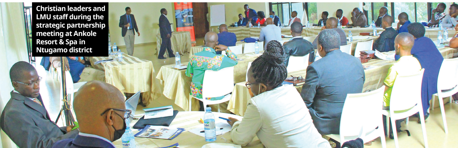
Christian leaders and LMU staff during the strategic partnership meeting at Ankole Resort & Spa in Ntugamo district

As a Municipal Education Officer, I can influence some headteachers that are Born Again and they mobilise their fellow headteachers and teachers in the region for training. This move will build our capacity and empower us to impact the lives of students in primary and secondary schools. I also plan to resume school visitations in my area of operation. I was in secondary school when I received Christ. Therefore, I am persuaded that programmes like retreats and camps where the Word of God is preached can leave a life-long impact in the lives of students.