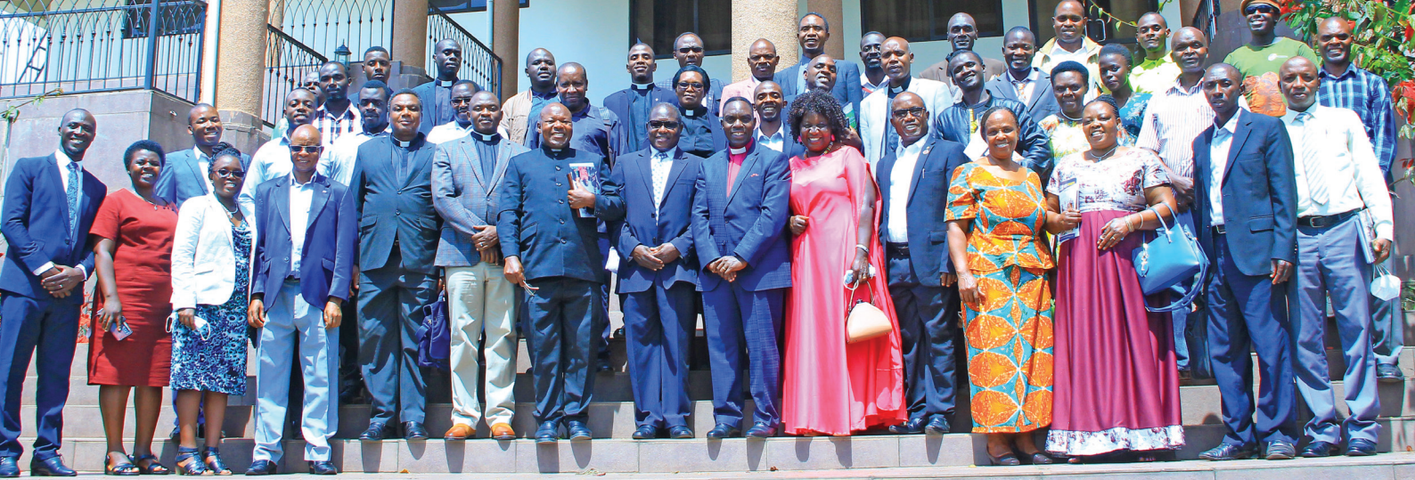
Christian leaders and LMU staff who attended the strategic partnership meeting in Ntugamo district on March 11