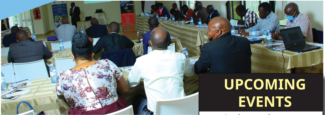
Christian leaders during the strategic partnership meeting

We trust God for wisdom and strength to follow through with every plan that was laid, every relationship that was built and every partnership that was formed for the fulfilment of the Great Commission in the region and beyond.